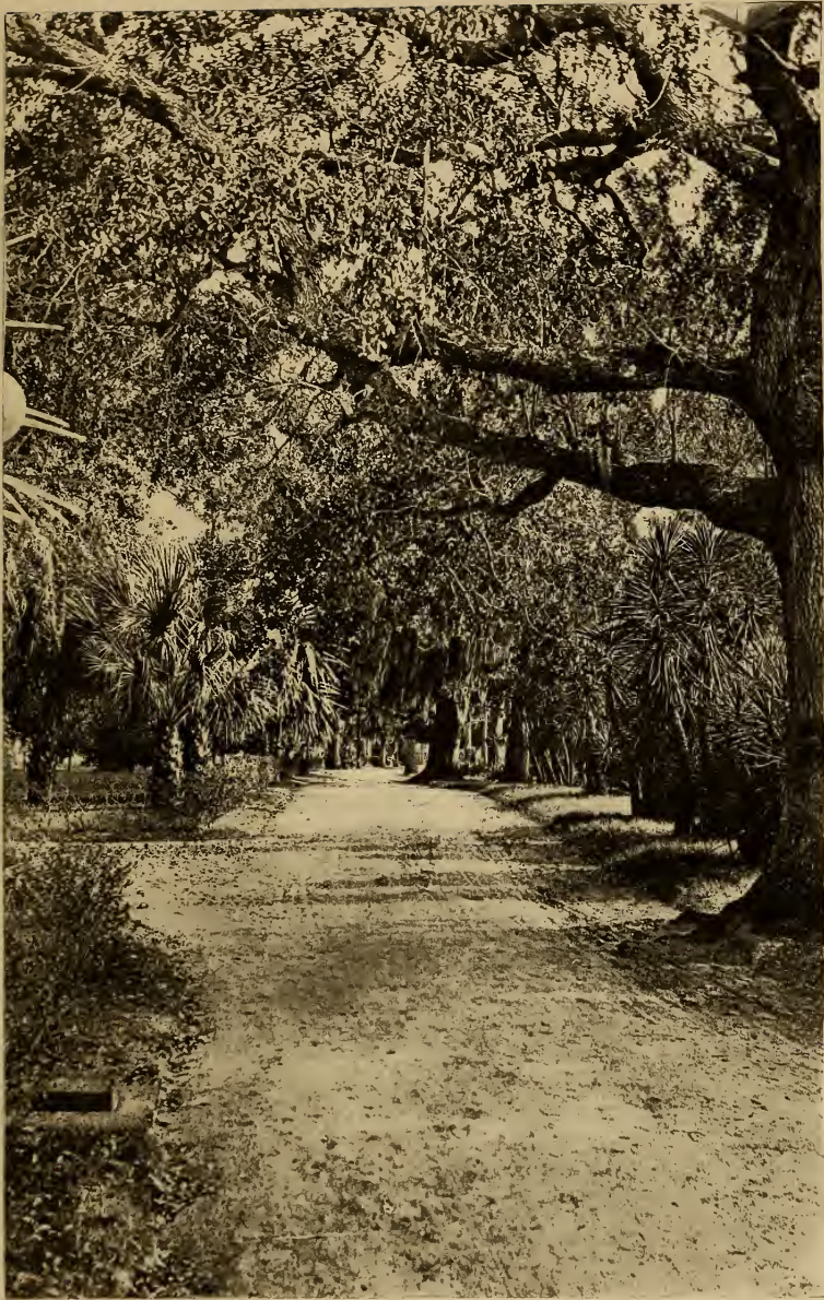
SOUTH END OF CLUB ENCLOSURE